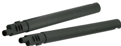
2pcs Long Wand