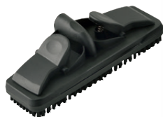
Floor Scrub Brush