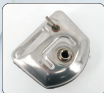
Stainless Steel Water Tank