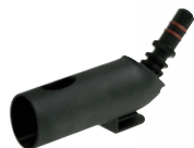
Adaptor for floor scrub brush