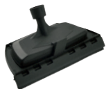
Windows Brush +Textile iron