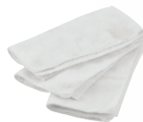
Cloth For Scrub Brush